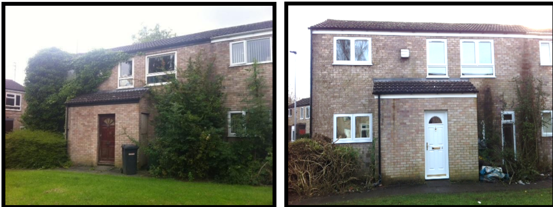
Barnstock, Bretton. - Empty 2 years and brought back into use through Empty Homes Partnership with Cross Keys Homes.

With current housing need in the city requiring all possible routes of finding and securing accommodation, all avenues have to be explored when looking at ways to increase the housing stock. In Peterborough, as it is across the country, demand is far outstripping supply.