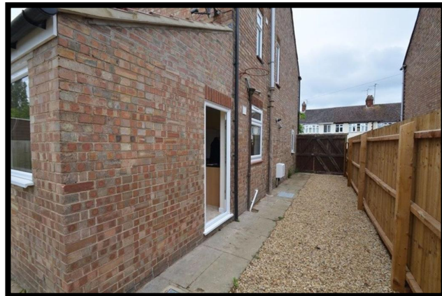
Vere Road - Empty 8 Years and brought back into use through an Empty Dwelling Management Order