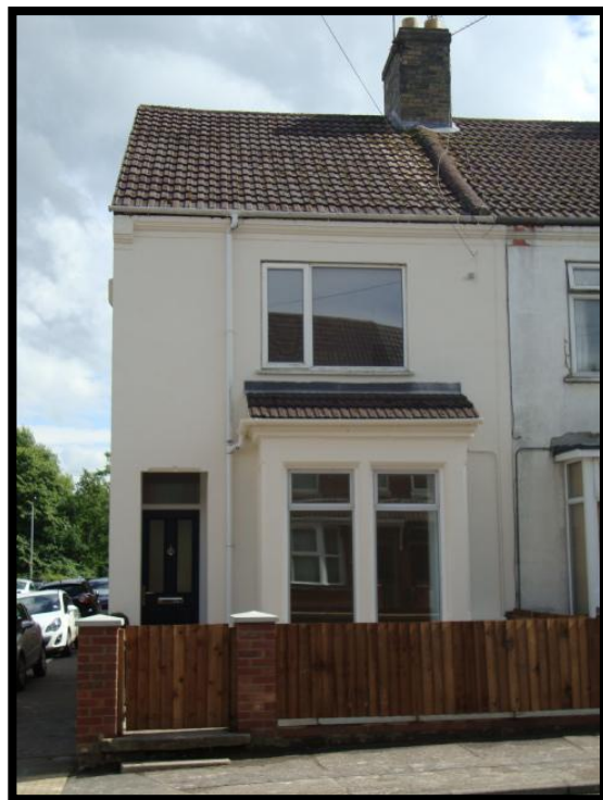
Fletton High Street - Empty 12 years and brought back to use through Empty Homes Partnership with Cross Keys Homes