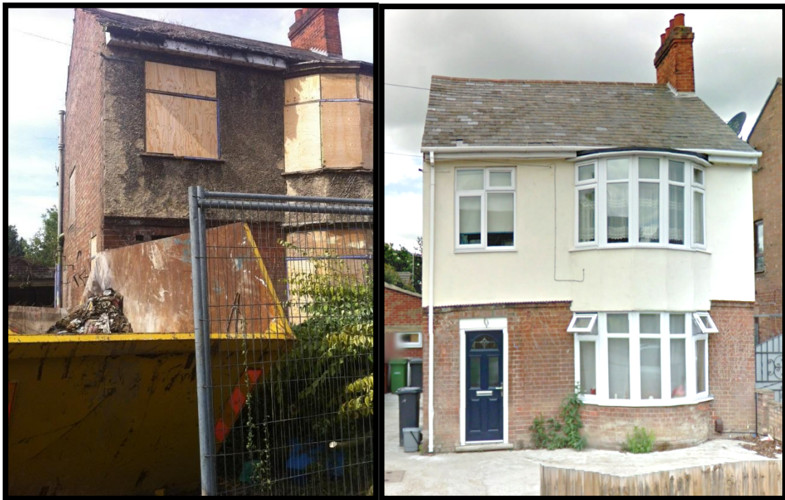
Fletton Avenue - Empty for 2 years and brought back into use through enforced sale and refurbished by the new owner

The Empty Homes Officer has collaborated in favourable press coverage about empty properties across the City on BBC Radio Cambridgeshire, BBC Look East, Heart FM and the Peterborough Telegraph. It is the Council's aim to keep the issue of empty properties and the work of the Empty Homes Officer regularly in the spotlight by regular press releases.